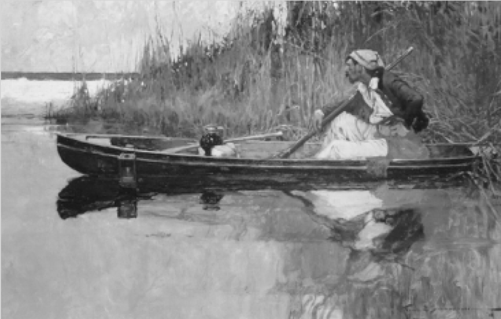
The Pirate by Frank E. Schoonover (1877-1972), 1911, oil on canvas.